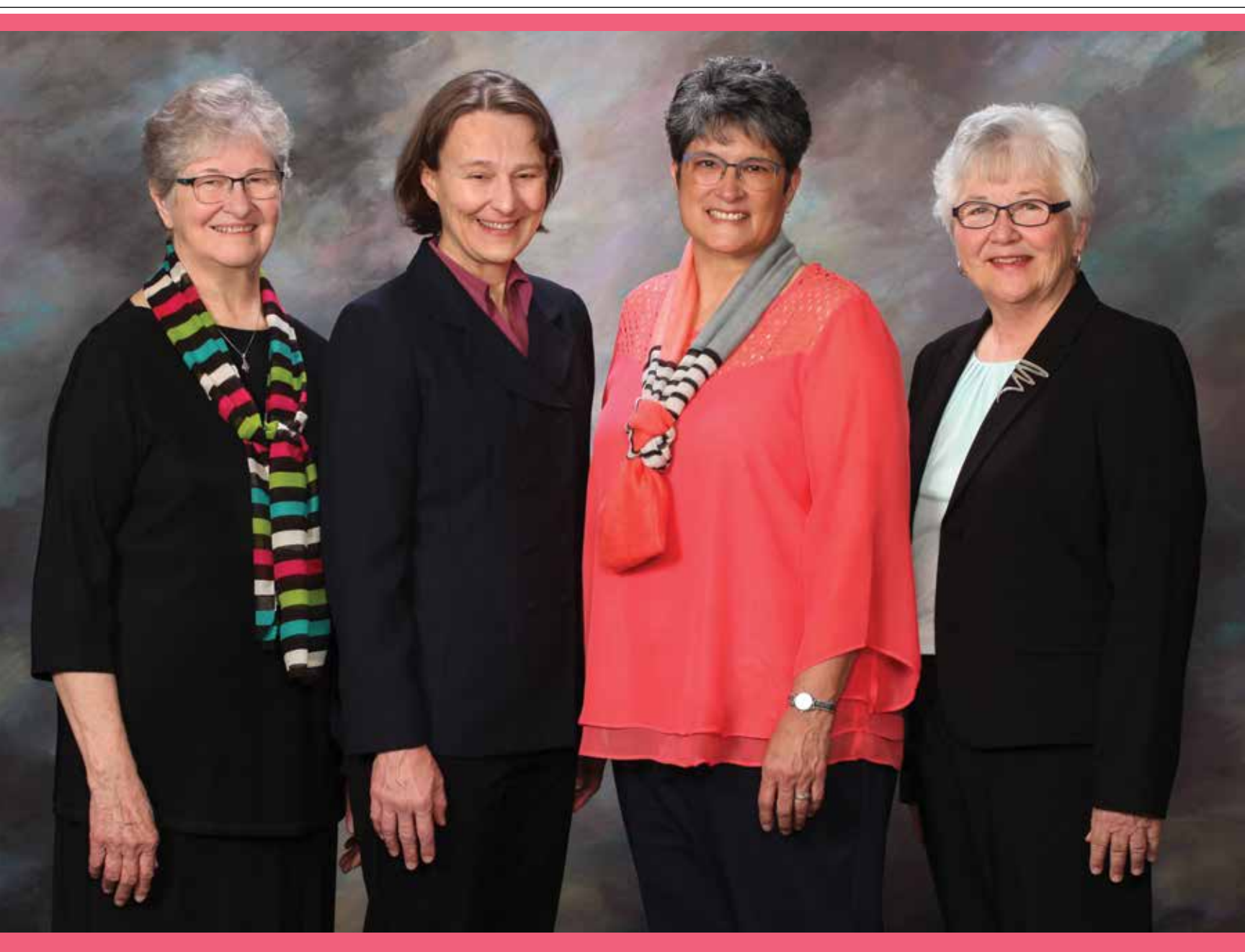
Sisters of the Presentation of the Blessed Virgin Mary and Associates | Dubuque, Iowa | Summer 2018