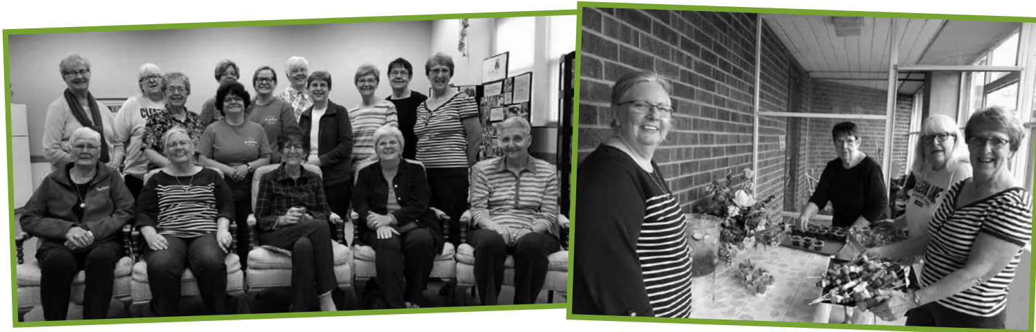
Left to right: Sisters and associates participated in Seeing with New Eyes: A Service/Awareness Opportunity focused on immigration and human trafficking; Participants set up a Garden Party for residents at Ecumenical Towers, an affordable housing complex for seniors and people with disabilities.