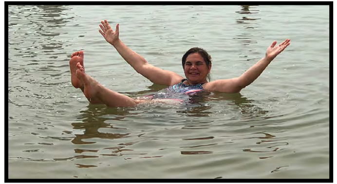
Floating in the Dead Sea