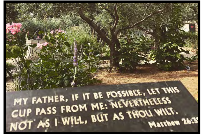
Garden of Gethsemane