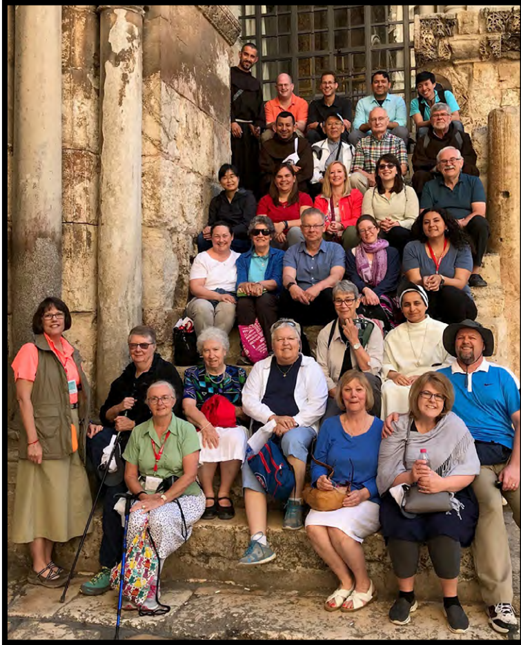
The group on the steps of the Holy Sepulchre