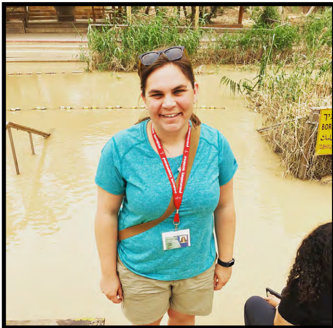
Baptismal site of Jesus, Jordan River