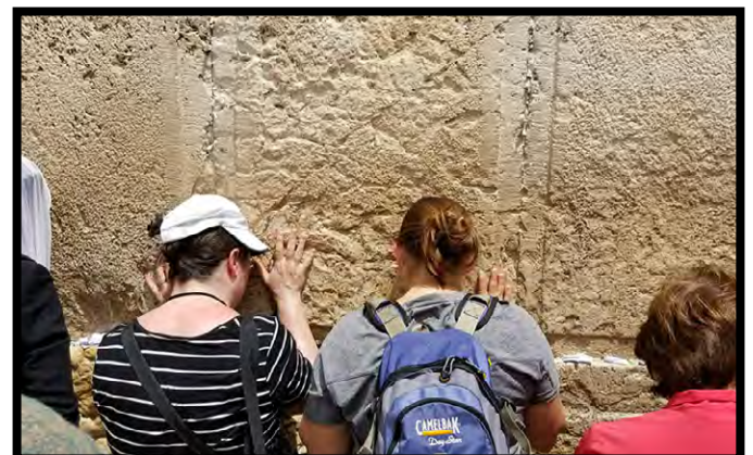
Praying at the Western (Wailing) Wall